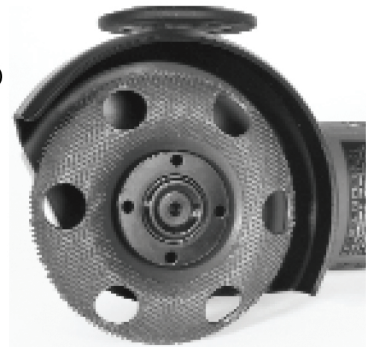
INCORRECT Nut Use

Discs: Over time and use, a section of the disc will