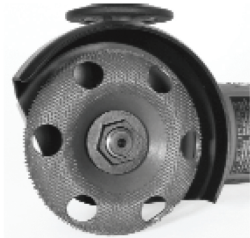
CORRECT Nut Use

Using our KAT Universal Nut , you can seat any style Holey Galahad® , but especially the round profile, over the arbor and tighten using a 21mm spanner or our Universal wrench over the hexagonal head nut. The depression in the nut seats over the arbor and securely tightens the disc.