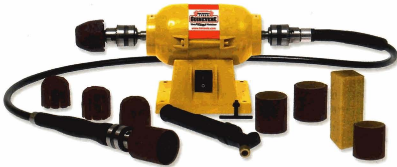
The complete Guinevere flexible finishing kit comes with the 1/2-hp motor, two chucks that open from 1/16" to 3/8", a 51" flexible shaft, two rubber sanders and four sanding sleeves of various grits.

Contact: King Arthur's Tools, 3645 Hartsfield Road, Tallahassee, FL 32303. Tel: 800-942-1300. www.katools.com